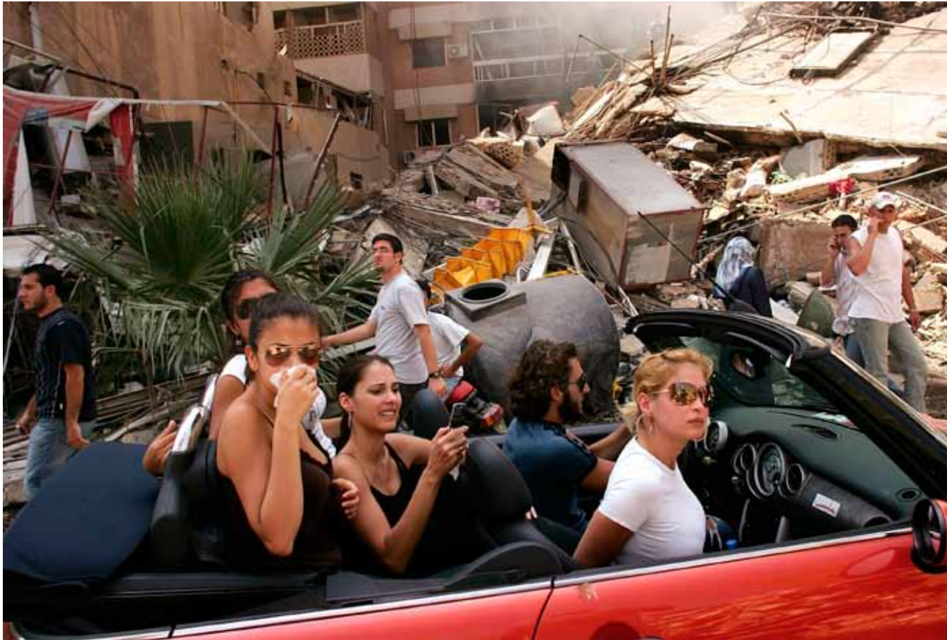
GUP #09